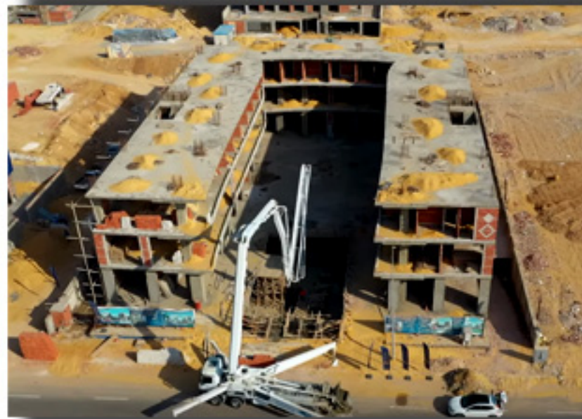
X-MALL during concrete pouring works