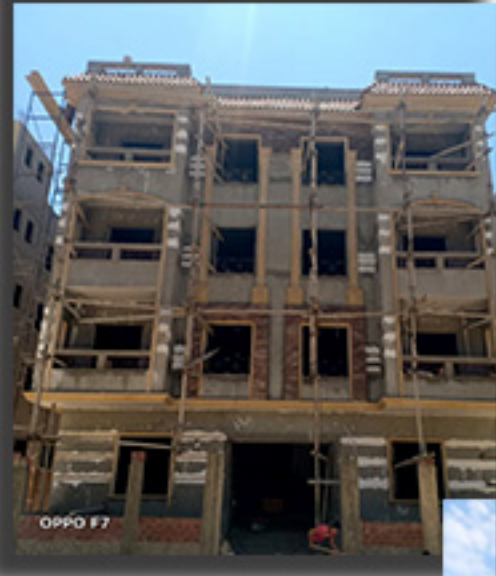
Facade works villa lotus 843