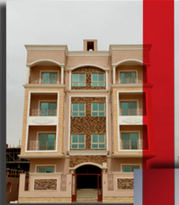
Facade works villa lotus 126