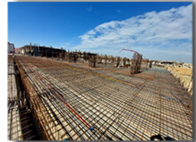
while slab reinforcement