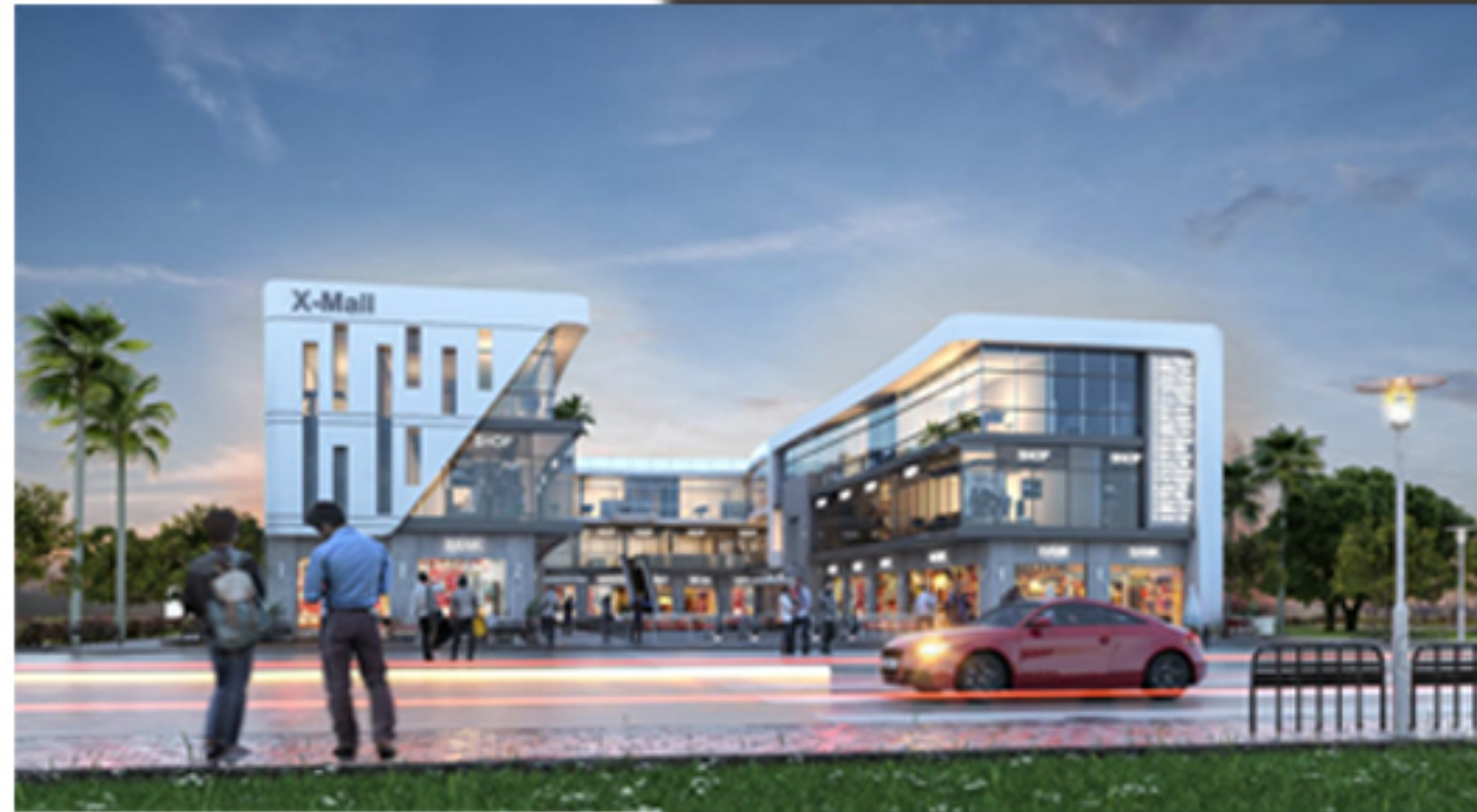
X-MALL PROJECT (Al Banafseg Services Area)