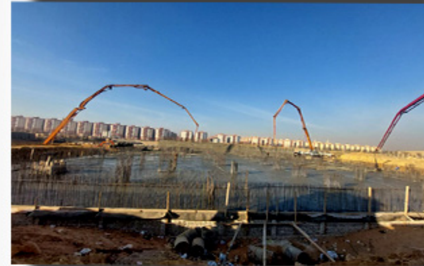
while pouring 4500 m3 of concrete