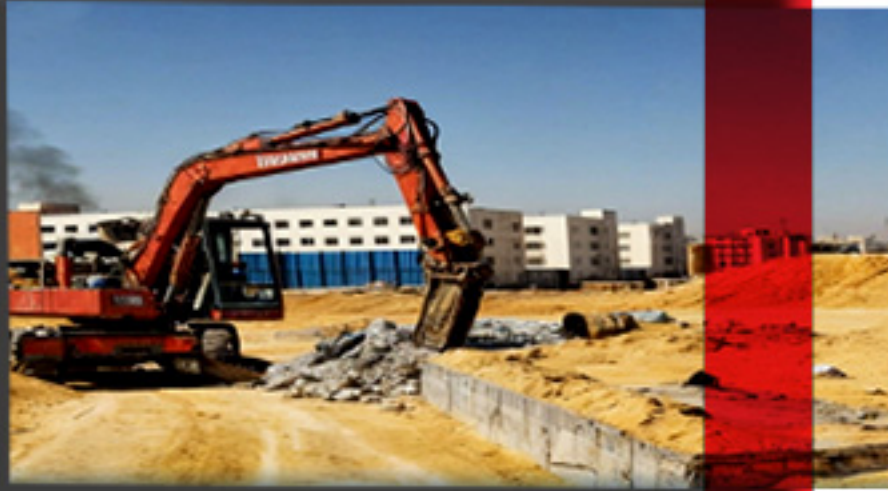
X-SQUARE during excavation