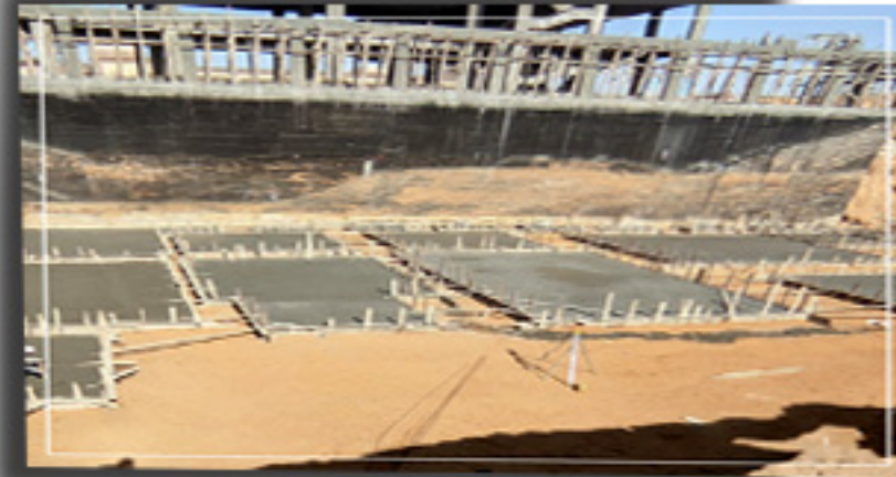
X-PLAZA during foundation