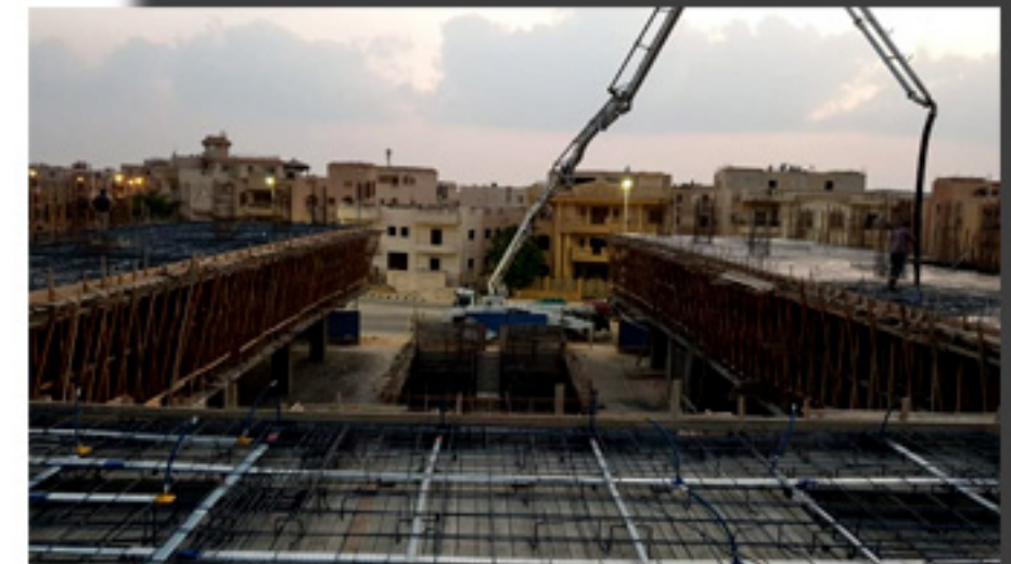
X-PLAZA during concrete pouring works