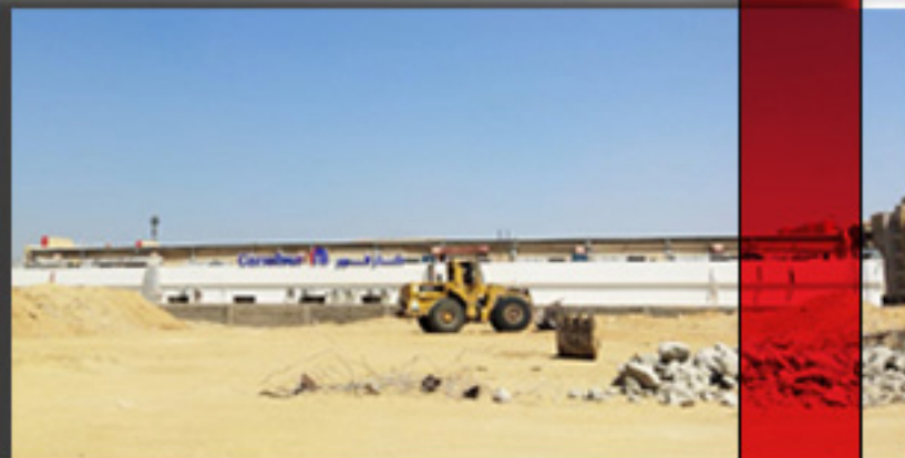
X-SQUARE during excavation