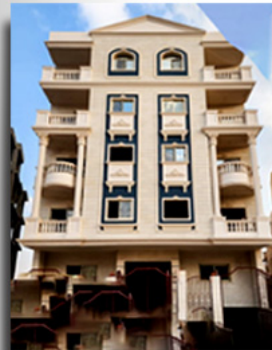
Facade Works at al andalos