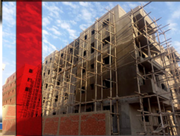
PLASTER Works villa 228 alandalos