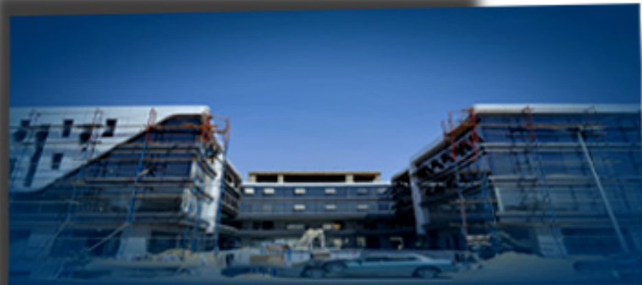
X-MALL during facade works