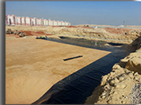
while soil replacement stage