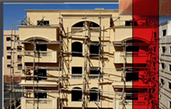
Facade Works villa 228 alandalos