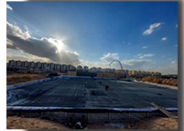
while raft reinforcement