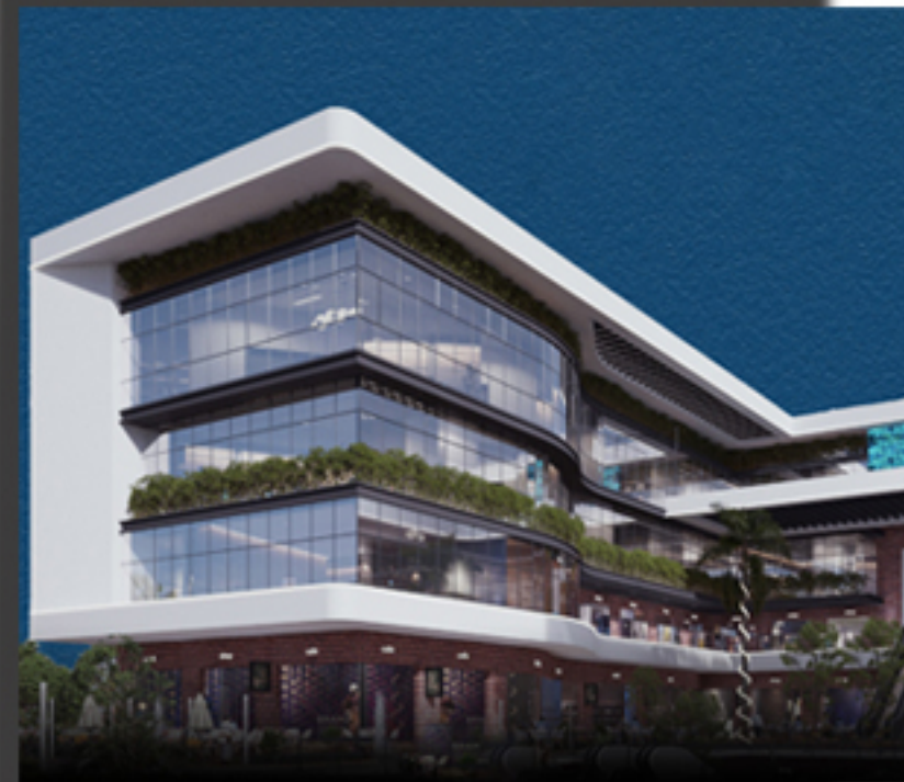
X-PLAZA PROJECT (Al Yasmeeen Services Area)