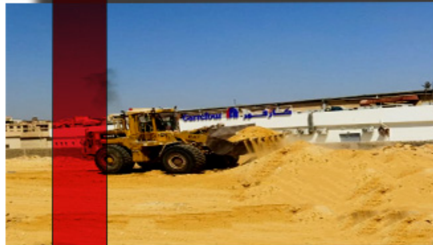
X-SQUARE during excavation