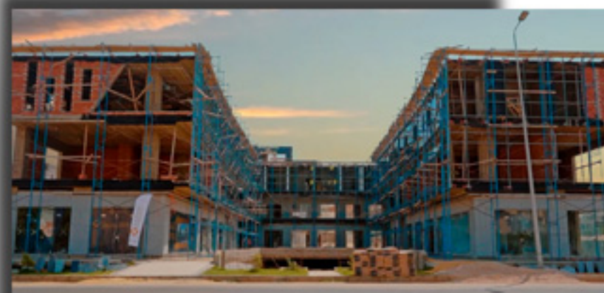
X-PLAZA during facade works